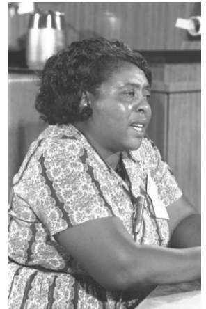
Mrs. Fannie Lou Hamer